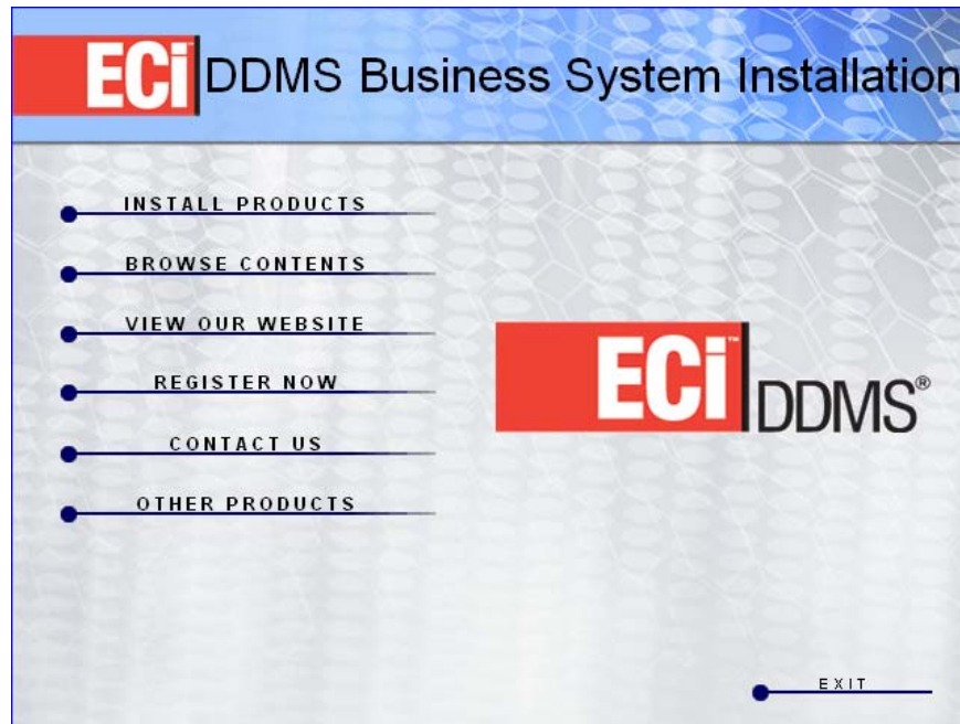
Figure 2: The Installation Window

When you manually install the DDMS client software on each client workstation, both DDMS software and .Net Framework 4.0 is installed simultaneously. You do not need to install .Net Framework 4.0 separately.