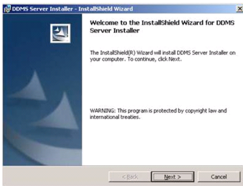
Figure 3: Installing DDMS Server Software

8 The Install Wizard window opens, as shown in Figure 3. After you read the information, click Next.